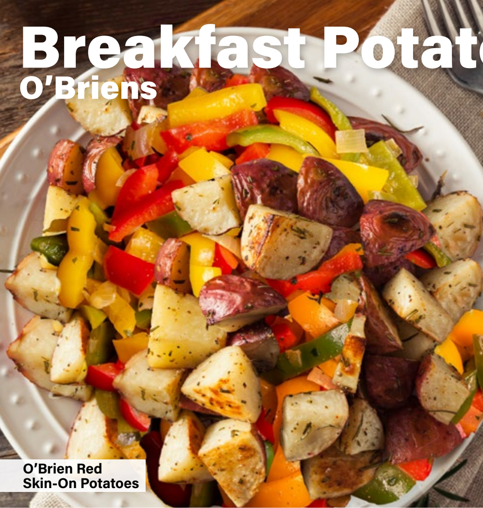
O'Brien Red Skin-On Potatoes