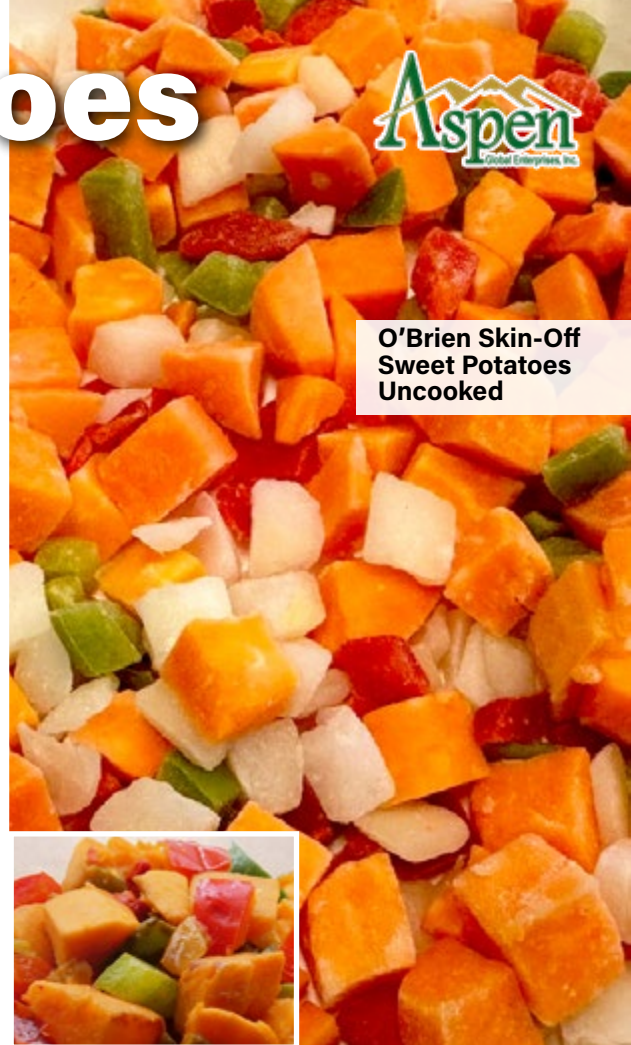
O'Brien Skin-Off Sweet Potatoes Uncooked