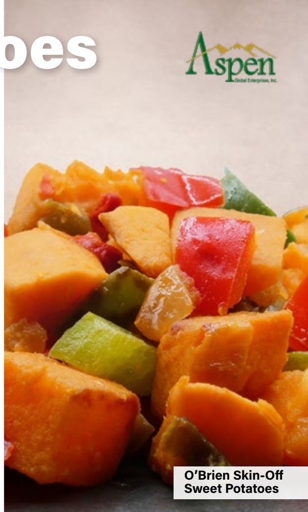
O'Brien Skin-Off Sweet Potatoes