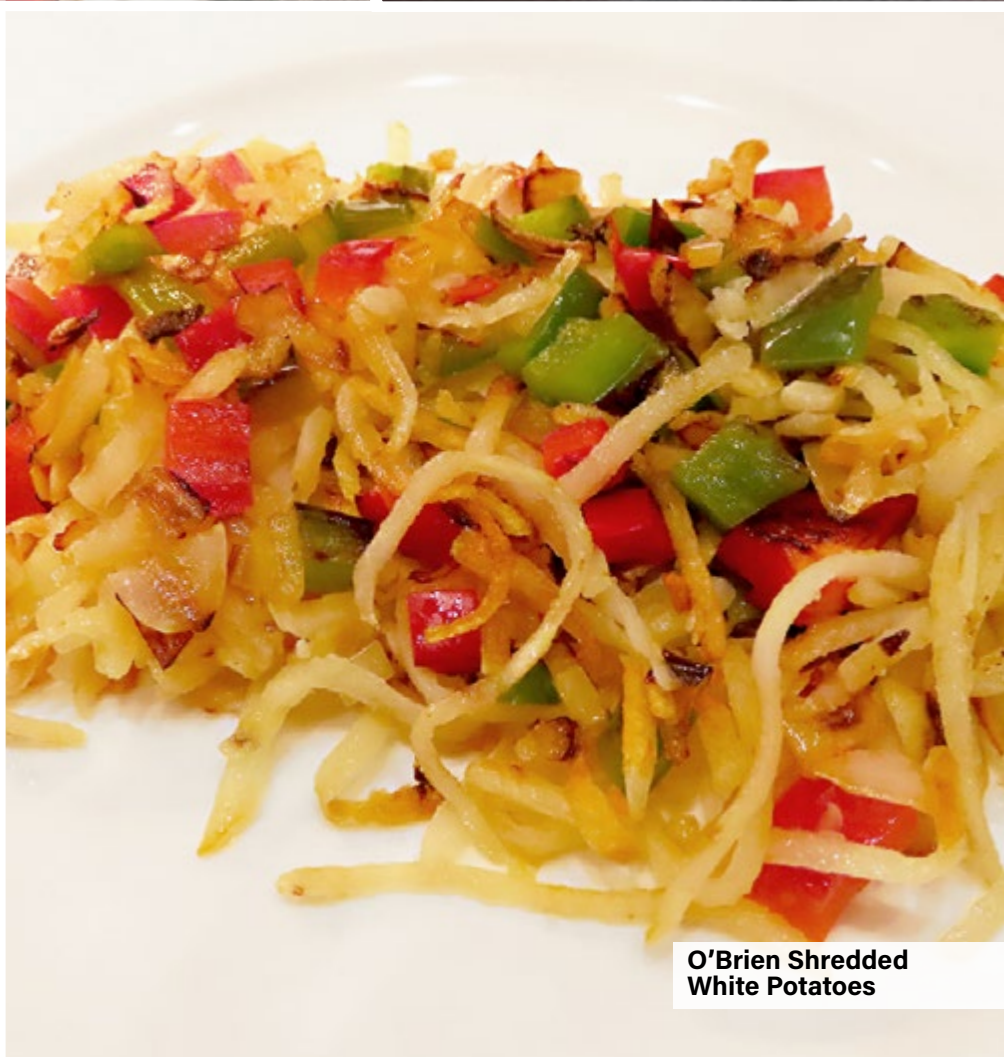
O'Brien Shredded White Potatoes