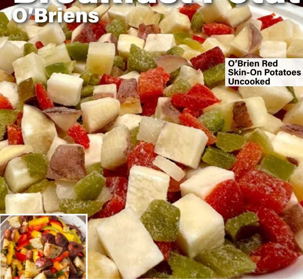
O'Brien Red Skin-On Potatoes Uncooked