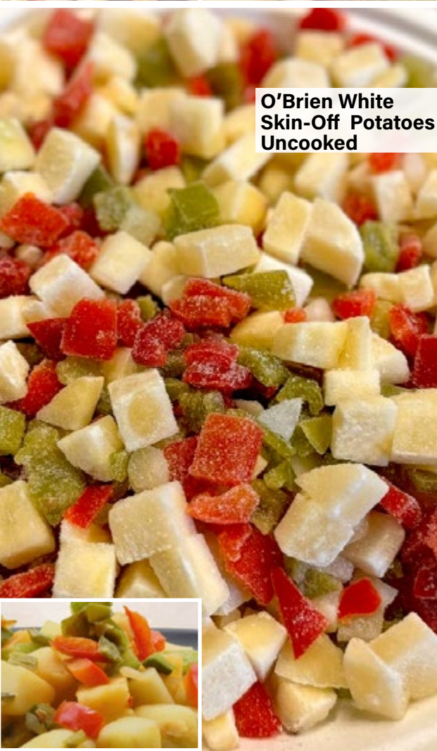
O'Brien White Skin-Off Potatoes Uncooked