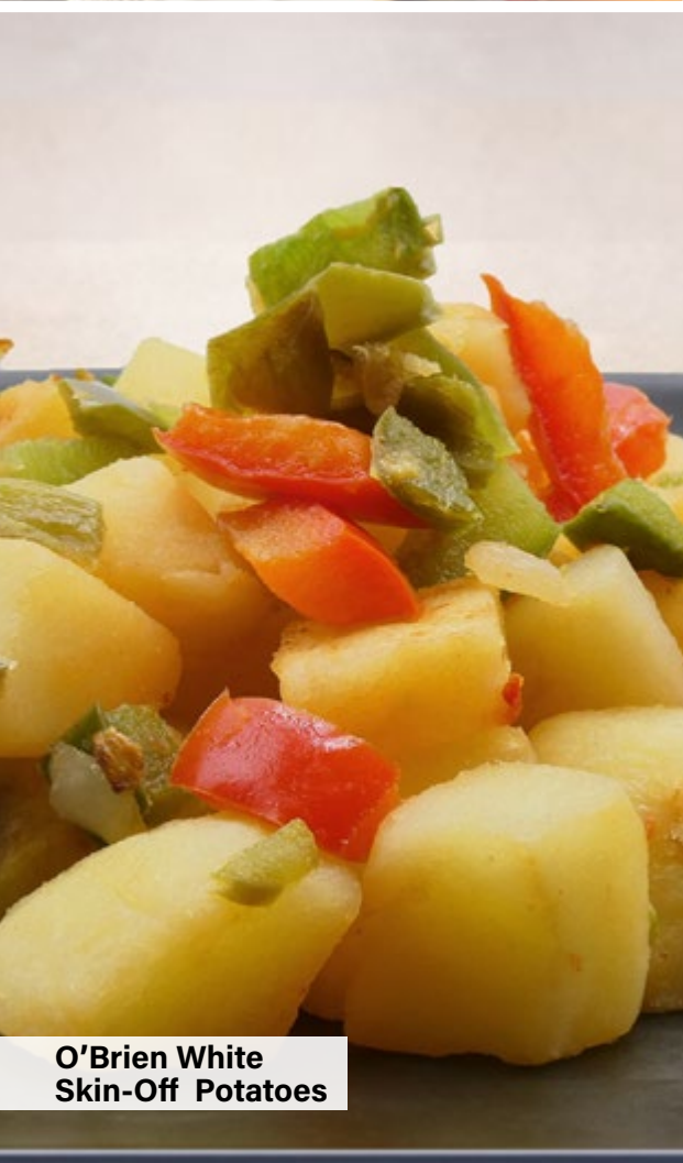
O'Brien White Skin-Off Potatoes