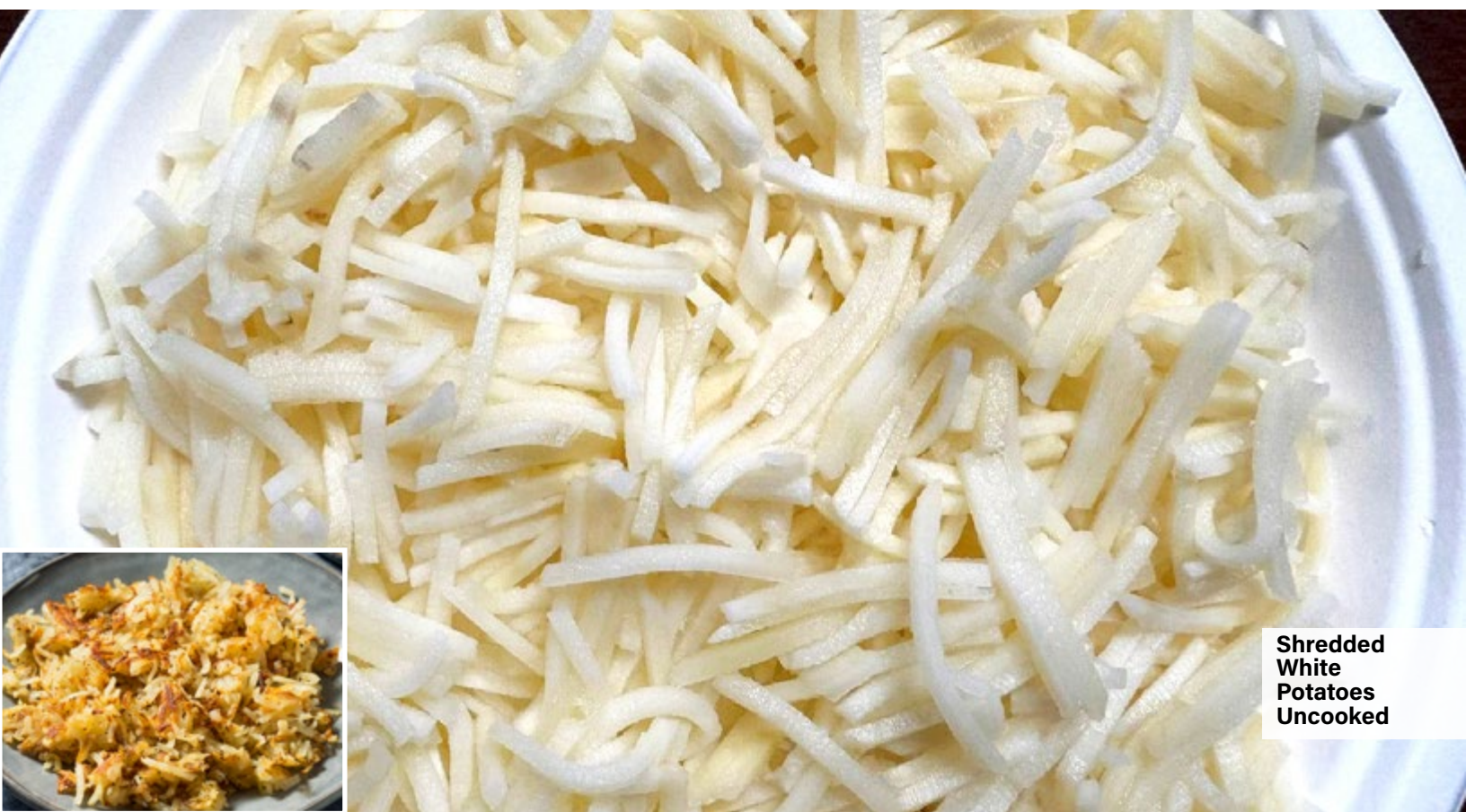
Shredded White Potatoes Uncooked