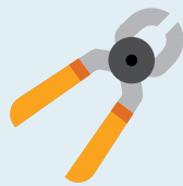
Tools and Components