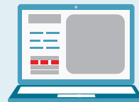
Digital, On-demand Training

Separately, each item within the portfolio addresses a specific critical issue—such as minimizing belt edge breakage—to bring processors one step closer to food safety and operational excellence.