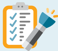
FMC Conveyor Program

You can. Introducing the Intralox® FoodSafe™ MPB Portfolio.